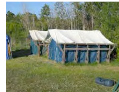
Cabin tents of bygone days

Within the Provincial Park there is a nature trail that provides a stimulating look at the diverse eco-systems that exist on our Saskatchewan Prairie. A small nature museum and pond dipping equipment also provide great opportunities for learning.