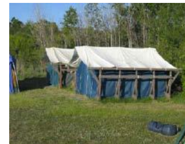
Cabin tents of bygone days

Within the Provincial Park there is a nature trail that provides a stimulating look at the diverse eco-systems that exist on our Saskatchewan Prairie. A small nature museum and pond dipping equipment also provide great opportunities for learning.